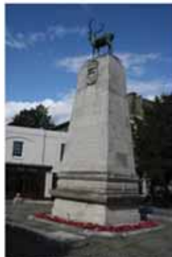
Hertford, Hertfordshire (WM1272)

Some of the secondary age sessions have helpsheets for specific subjects or advice on planning visits. One of the sessions discusses the threats to war memorials and what they can do to address this. It includes the slide above which highlights damage to the Hertford war memorial due to skateboards being used on and around it.