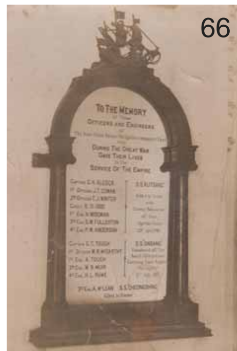
Mystery 66

Featured in Bulletin 102, and shown again below, Mystery 66 is a war memorial commemorating the fallen from the Indo-China Steam Navigation Company. It was previously thought that the company was based in the Newcastle area. Research by a supporter indicates that the company was based in Hong Kong and it does not appear the memorial is connected to Newcastle-upon-Tyne. Any further information from others would be welcome.