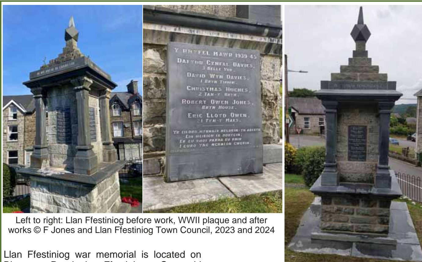
Left to right: Llan Ffestiniog before work, WWII plaque and after works

Llan Ffestiniog war memorial is located on Blaenau Road in Ffestiniog, Gwynedd ( WMO/124455 ). Blaenau Ffestiniog, which includes Llan Ffestiniog, is a UNESCO World Heritage Site.