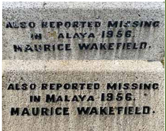
Corby Glen before and after works

In 2020, £1,000 from War Memorials Trust Grants Scheme supported repair and conservation works. These had been stimulated by a local research project during the centenary of World War I. The memorial was cleaned using a DOFF steam system. Damaged lead lettering was repaired to reinstate the original inscription and the lead was re-painted to improve legibility. The surrounding railing was refurbished and re-painted to match the original design.