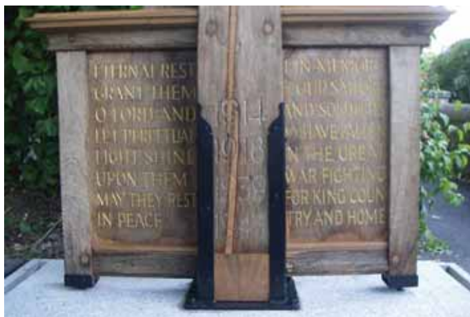
Top: Axminster before and after works Above: the inscription after works