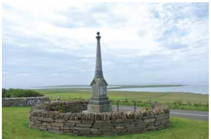
Stronsay war memorial, above, in Orkney, Scotland is located on the roadside of Ward Hill ( WMO/147860 ). It received a grant of £715 towards repair and conservation in 2015. The works included gentle cleaning, repairs to the lettering and hard landscaping.

If you can help with any of these cases, go to www.warmemorialsonline.org.uk/search and enter the 'WMO/' number in the Keyword search. You can upload your photos directly to the War Memorials Online record and add a condition update there too. You can choose from four condition levels – Good, Fair, Poor or Very bad. WMT will then be notified of your update via email so we can acknowledge it and take any appropriate action. It is always great to hear that war memorials are in Good condition and are being well looked after. Our statistics show that the vast majority are. But our priority is to find those that need help so the Conservation Team can work with the custodians to address these.