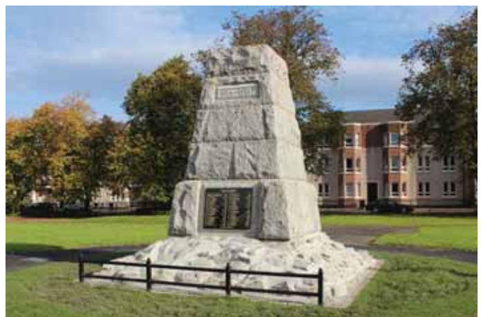
Yoker war memorial, above, is located in Yoker Park on Dumbarton Road in Glasgow ( WMO/71007 ). In 2016, it was awarded a grant of £3,600. The memorial had significant mortar loss, masonry had attracted biological growth and pollution surface dirt, sections of the base were damaged and pointing had failed. The memorial was repaired and cleaned using low pressure steam.

Above and right: Stronsay; Yoker; Alsagers Bank; Halifax South African War; St Oswalds RC Parishioners WWII; Irthlingborough