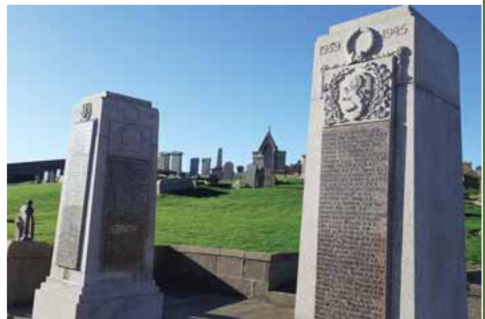
Top to bottom: Both war memorials before works; Both after works; and Gates after works (WM12382 and WM12453)