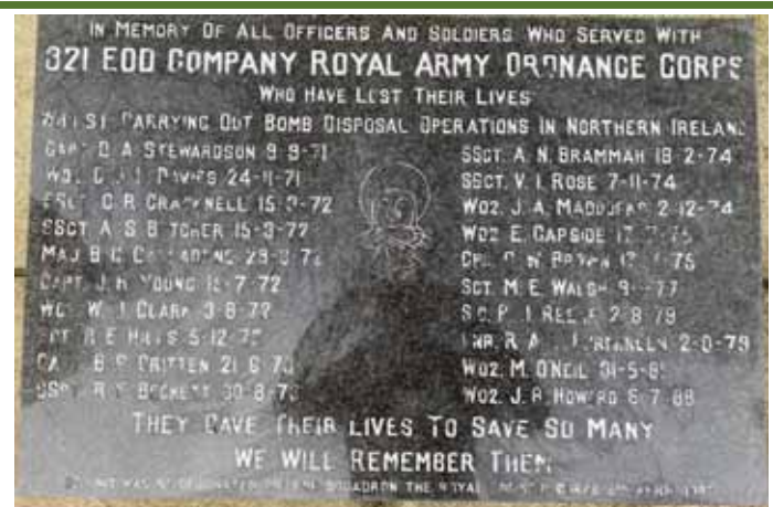
321 EOD

If you have not received our correspondence or are unsure if you have taken action please get in touch via the details on page 2. The bank details on page 15 are the new details so if you are able to update these via online or telephone banking we would encourage you to do so. Alternatively, anyone not yet a member or regular supporter can set up a new standing order using this information to help protect and conserve war memorials.