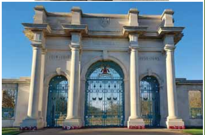
Top: Aerial image © Britain from Above EPW021048 English Heritage via War Memorials Online, 1928; Middle: Statue and gate in 1920s © Unknown; Bottom: After recent work (WM2421) © Nottingham City Council, 2022