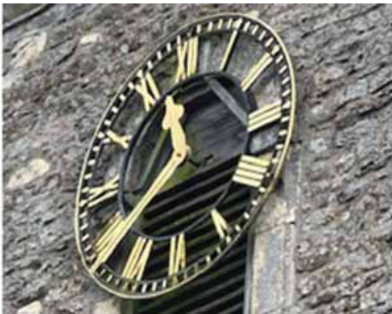
Top: the internal mechanism after work; Middle: church and clock faces before works; Bottom: face of clock after works (WM7455)