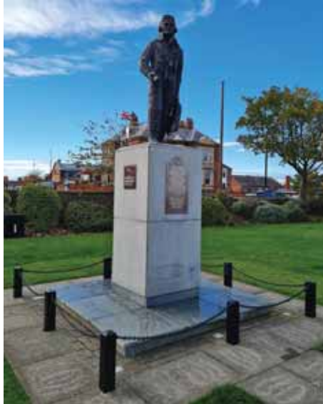
RAF North Coates Strike Wing (WM5955)

If you are yet to make a donation, and are able to do so, visit www.warmemorials.org/appeal to make a credit/debit/PayPal gift or find details for a bank transfer. Or, use the form on page 16 to send a postal donation. A gift of any size will make a real difference.