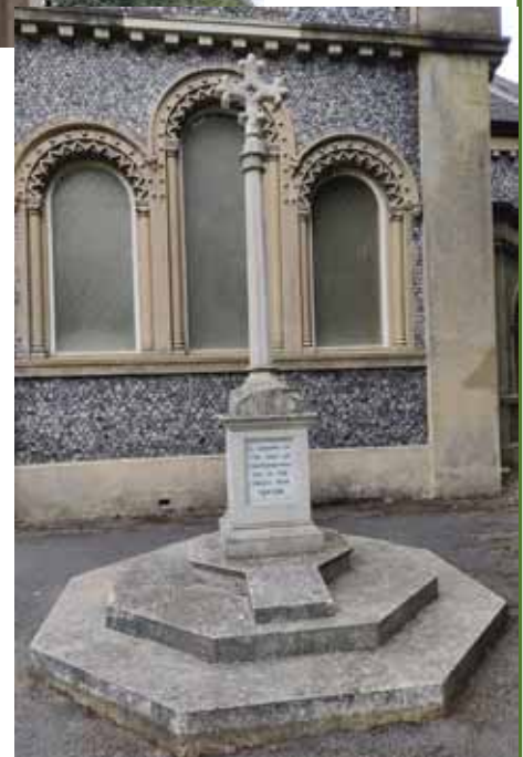
Top: Damaged cross and Above: memorial after works (WM11819)