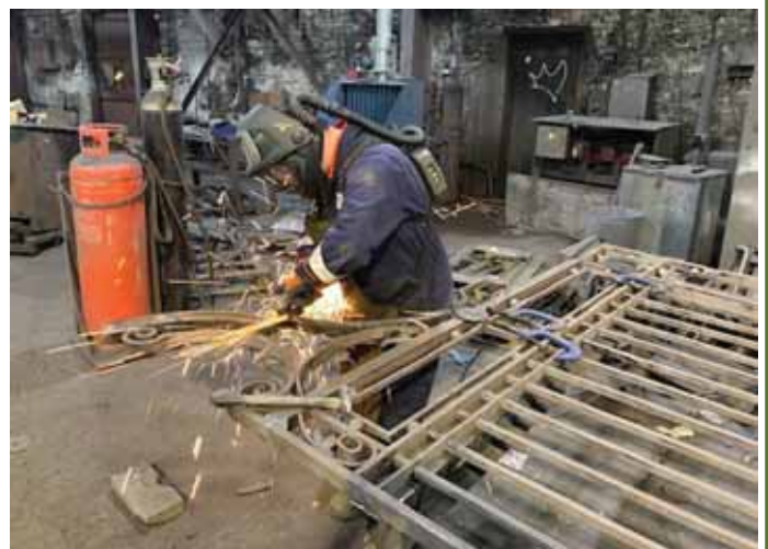
Top left and above right: Site and gates

Following that World War I centenary project, Zetland Park benefitted from a £1 million National Lottery Heritage Fund regeneration grant. This included a second phase of works for the war memorial to which War Memorials Trust Grant Scheme, supported by Historic Environment Scotland, made a £30,000 contribution. This addressed the extensive conservation and repair works needed to the gates and railings. The metal gates were badly corroded and no longer functioning. It was necessary to take them down and transfer them to a local foundry for a condition assessment.