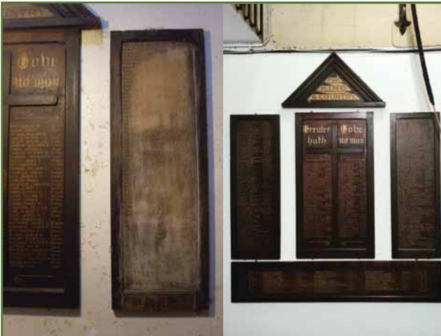
Above: Plaques before and after work (WM10185) Below: New names plaque during works

200 parishioners of St Gabriel's, Pimlico were lost during World War I and in 1920, pending the raising of funds for a permanent stone memorial, the congregation erected a temporary oak memorial in the grounds of the church (WMO/ 238149 ). Subsequently, they failed to raise enough money for a stone memorial and in 1928 the temporary wooden memorial was relocated inside to the North Porch, where it still resides. It recorded people by surname, first name and rank.