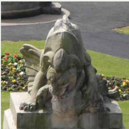
Grangemouth war memorial

Our first front cover of the year shows Grangemouth war memorial. Located in Zetland Park, Falkirk it has benefitted from a number of grants in recent years and you can find out more on pages 10-11. The World War I centenary stimulated interest in the condition of the war memorial but works have continued beyond that due to its varied elements. The memorial has been controversial since it was unveiled as the highly emotive sculpture sees the German eagle being devoured by a lion. The list description refers to the lion representing the British Empire but others may see it as Scottish.