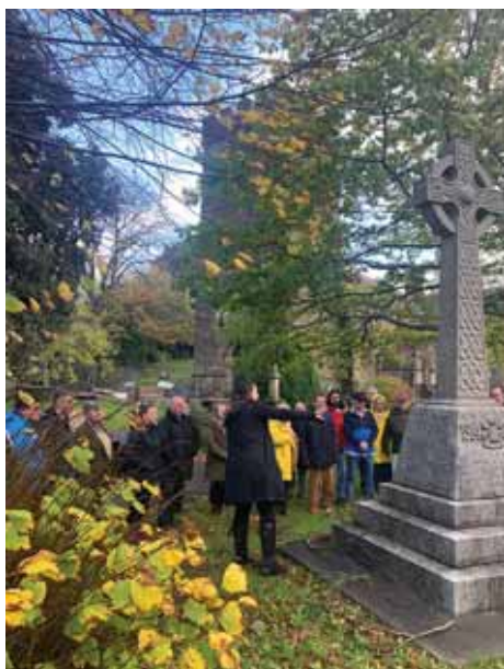
Llanelli workshop

On 8 th November our first post-pandemic workshop was held in Llanelli, Wales. The half-day session included an introduction to the Trust and its conservation work, a guide to using War Memorials Online as well as details of grant funding and best conservation practice. Attendees visited the 4 th Battalion, The Welsh Regiment war memorial at St Elli's Church following which a condition survey was added to War Memorials Online (WMO/ 268879 ).