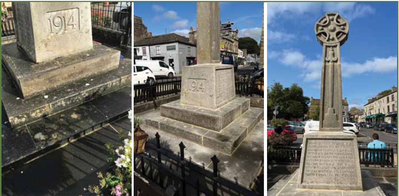
Leyburn before and after works (WM695)

Leyburn war memorial is a Grade II listed sandstone wheel cross located on the north western edge of the Market Place (WMO/93996). It is sited in Leyburn conservation area in North Yorkshire. The shaft of the memorial has a carved downward facing sword. It stands within a paved area surrounded by a low wall and metal railings which were added around 1960. The names of the fallen from World War I are inscribed on the front face of the plinth.