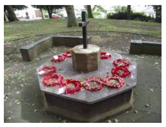
The memorial following the 2002 addition of a cross

This is an example of the importance of recording a war memorial. If something happens to it, whether weather damage, vandalism or theft, then reinstatement works are supported by clear historical evidence of the original and communities can ensure that the choices made by the loved ones of the fallen when they originally erected their war memorials are respected and maintained. You can help this in a number of ways, making sure there is a record on War Memorials Online (p11) is a start but for freestanding war memorials such as this one in England making sure it is listed can be a great help. Adding a war memorial to the National Heritage List for England ensures its importance is recognised. It also means a description, image, available historical detail and a recording of its inscriptions is held in the statutory record - a national collection which people can access if they need to find details. Through the First World War Memorials Programme there is an ambition to list an additional 2,500 war memorials through the centenary so if you want your local memorial to be one of them turn to page 10 to find out how.