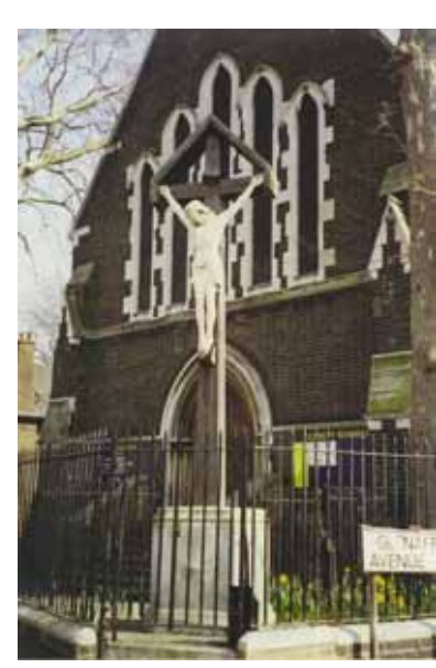
Isle of Dogs, London (WM88) ^{\circ} WMT, 2015

We hope you will consider helping us with this important project to protect war memorial heritage in England by using one of the above routes to apply for the listing of your local war memorial(s).