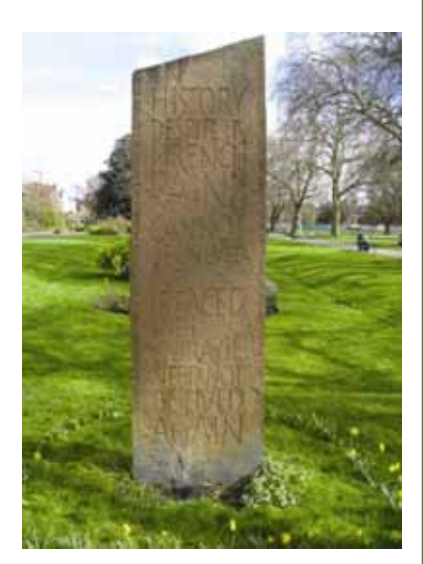
Kennington civilians memorial, London

The new resources cover the main events of World War II, with different versions for primary schools and secondary schools. While giving an overview of these events, the new resources also focus on how those events are now commemorated and what the impact of them on communities was, by looking at some of the war memorials that remember them. This includes the Kennington Park Civilians memorial, shown in the photo to the right. This memorial commemorates the people who died in 1940 when a bomb fell on the air raid shelter in Kennington Park. Other subjects taught through these resources include evacuation, the role of women during the war and, for older pupils, events such as the Holocaust and D-Day. Pupils also have the opportunity to reflect on recent commemorations of the end of the war and how these memorials are still important parts of community history.