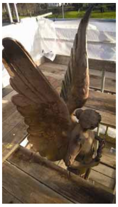
Works to the Peace sculpture © WMT, 2016