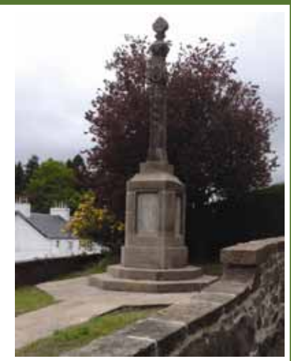
Strathblane, Stirling (WM4935)

In early 2016, a grant of £2,410 was offered for repair and conservation works. To address a build up of soiling and biological growth, cleaning of the memorial and its paving and steps using water and natural bristle brushes was undertaken. Defective mortar was carefully unpicked from the memorial and boundary wall. These joints were re-pointed using a lime mortar. Some deepening and sharpening of deteriorated lettering was undertaken to improve legibility.