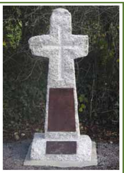
Howle Hill, Here (WM8837) Walford Parish Council, 2015