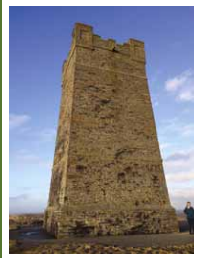
Before (above) and after (below) works on The Kitchener Memorial