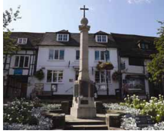
East Grinstead, West Sussex (WM2957)

If \operatorname{nucleon} \operatorname{Id} , the including or title will then be added to the National Heritage List for