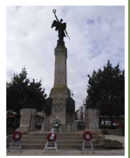
Derry/Londonderry, Londonderry (WM6036)

As we often find on such visits different parts of the country have their own unique challenges. This can relate to materials from which war memorials are constructed, common features/designs or specific issues. Northern Ireland has its own set of concerns which emerged. Delivering a series of workshops such as this ensures War Memorials Trust can develop a better understanding of an area which can help improve our responses to enquiries from specific regions. We can also help address any local 'myths and legends' to ensure everyone has the right information to make informed decisions about war memorials.