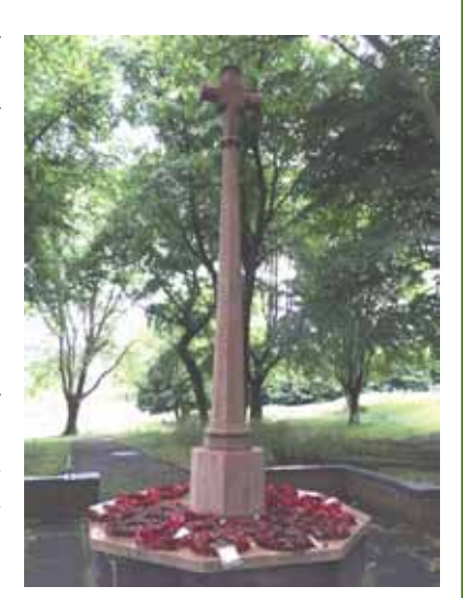
Reinstated cross

This is an example of the importance of recording a war memorial. If something happens to it, whether weather damage, vandalism or theft, then reinstatement works are supported by clear historical evidence of the original and communities can ensure that the choices made by the loved ones of the fallen when they originally erected their war memorials are respected and maintained. You can help this in a number of ways, making sure there is a record on War Memorials Online (p11) is a start but for freestanding war memorials such as this one in England making sure it is listed can be a great help. Adding a war memorial to the National Heritage List for England ensures its importance is recognised. It also means a description, image, available historical detail and a recording of its inscriptions is held in the statutory record - a national collection which people can access if they need to find details. Through the First World War Memorials Programme there is an ambition to list an additional 2,500 war memorials through the centenary so if you want your local memorial to be one of them turn to page 10 to find out how.