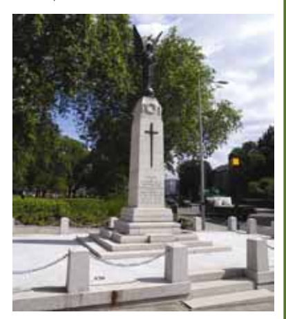
Completed works © 1 Regeneration Project, 2016