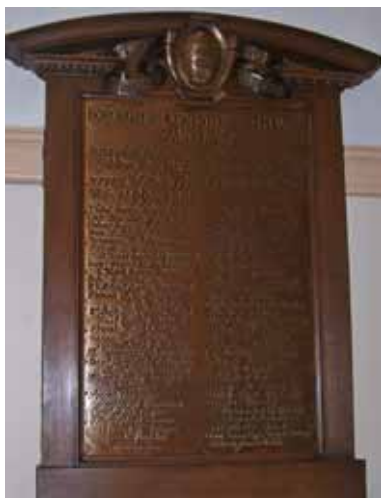
Kingston Library memorial plaque following conservation works