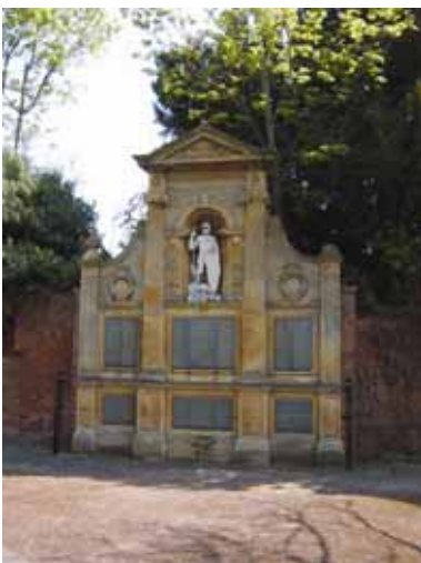
Lichfield war memorial before

Works to the wider Remembrance Garden included stabilisation and rebuilding of gate piers and balustrading. The proposals formed part of a bigger project for the Remembrance Garden and the associated linked open spaces which form the park. This project had successfully received grant funding through the Heritage Lottery Fund. The Grants for War Memorials scheme offered the maximum grant available at the time of £10,000 towards the freestanding memorial elements of the project which totalled just over £60,000. The final grant payment upon completion was £9,287. The overall project was given an award by the British Association of Landscape Industries in 2012.