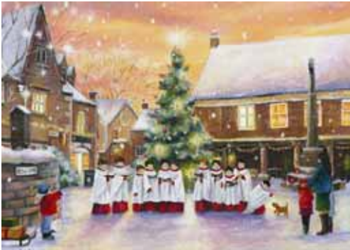
'Carols in the snow' design

For those of you already planning for next Christmas, the Trust has a limited number of our 2012 Christmas cards available for the reduced cost of £2.50 plus 75p p&p per pack of 10 cards (£3.25 total).