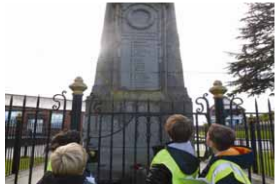
Pupils studying Bream war memorial, Gloucestershire (WM736)

It is wonderful to get such positive feedback and know that we are helping young people understand more about war memorial heritage.