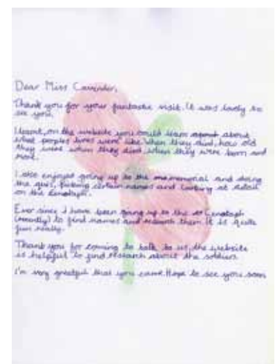
One of the thank you letters from pupils in Gloucestershire