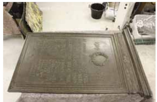
Cox and Kings World War I plaque after repair