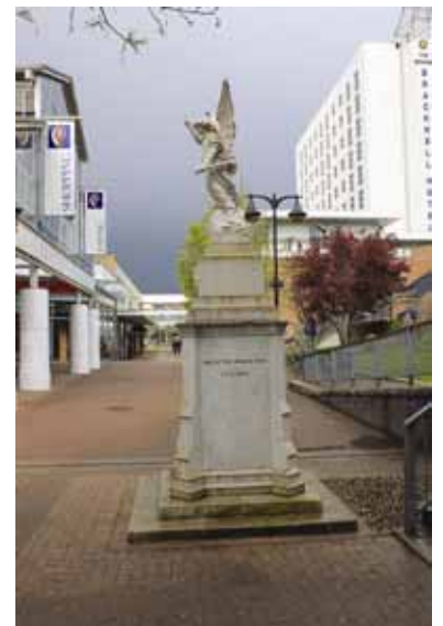
Bracknell war memorial, Princess Square

Due to concern over the suitability of a further move for the memorial and the risk posed to its fabric, War Memorials Trust took the step to apply for the listing of the memorial in April 2012. The memorial was subsequently successfully listed at Grade II.