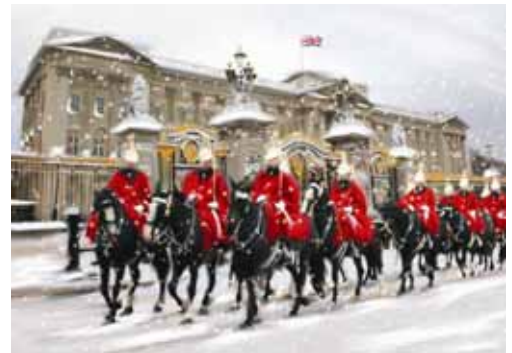
'Cavalry in the snow' design

The cards measure 16 x 11.5cm (6¼ x 4½ inches) and come in packs of 10. Inside both card designs there are details of the charity alongside the message 'Season's Greetings'. Please use the order form on page 15 or visit the Trust website to obtain your packs.