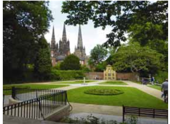
Lichfield war memorial after © Lichfield District Council, 2011

Lichfield Remembrance Garden is located by the side of Minster Pool and is listed Grade II on the English Heritage Register of Parks and Gardens. The Remembrance Garden forms part of a much wider park landscape which is made up of distinct interconnected spaces in the centre of Lichfield dating from the 17 th to 20 th centuries. The surrounding garden walls, balustrade, gate and war memorial screen are Grade II listed structures. The list description states that the walls, balustrade and gate predate the memorial screen being from the 18 th and 19 th centuries.