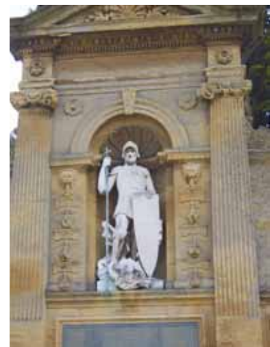
St George figure before