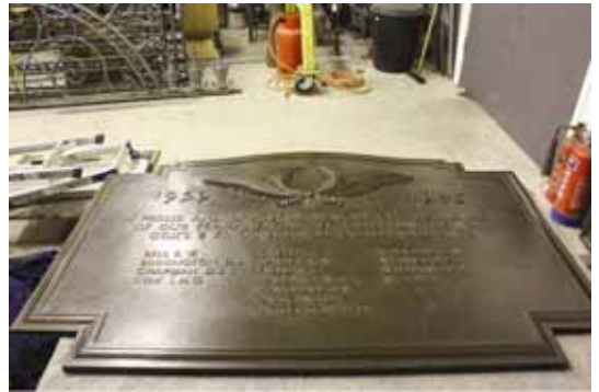
Cox and Kings World War II plaque after repair

In 2012 a successful approach was made to the hotel who agreed to offer the memorial plaques a new home as a number of historical items relating to the buildings previous use are already on display. The two bronze plaques were delivered to the hotel in November 2012. They are currently awaiting re-erection.