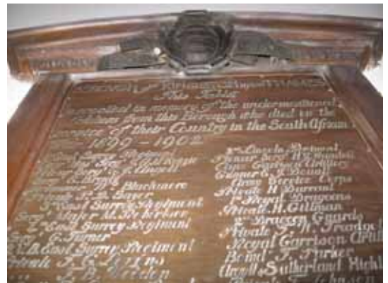
War memorial plaque before works commence with traces of white residue on incised lettering from a previous clean

Following inspection of the plaque, it was found that the copper sheet containing the roll of honour was in a good condition, in spite of being slightly warped which is common for this type of copper plate treatment. On inspection, the contractor believed that it was probably cleaned sometime over the last 120 years with a cutting compound as there were still traces of this left in some of the incised letters. The copper had naturally patinated to a lovely finish, and only required a light clean using a toothbrush to remove traces of the residue from between the lettering then an application of microcrystalline wax to its surface. The oak board was re-varnished, then the tablet was returned to the wall of the library.