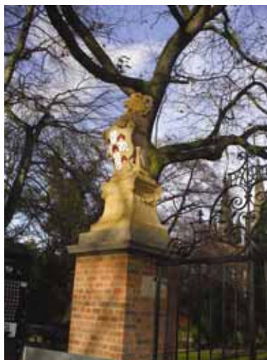
Lichfield war memorial before