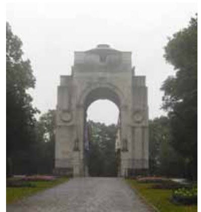
Lutyens' memorial arch in Victoria Park, Leicester