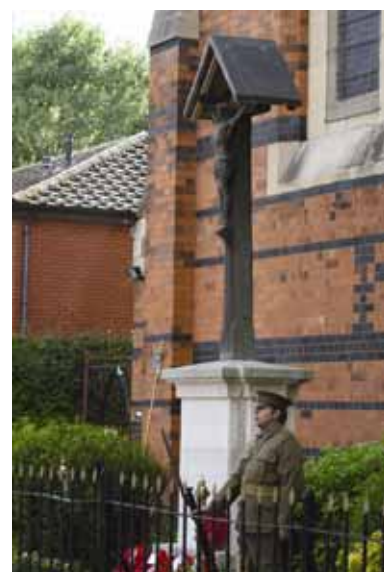
St Paul War Memorial which benefitted from an HLF grant

In October last year HLF announced an additional £6million for small grants to enable young people working in their communities to explore, conserve and share local heritage of World War I, including war memorials. This scheme will run for six years from early 2013. More details will be available on the HLF website later in the spring.