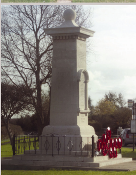
St Athan war memorial is one of many that received a grant trough the SGS for its conservation and repair.

Many local communities are seeking to ensure their war memorial is in a fit state to mark the 90th anniversary of Armistice Day in November. We hope you will respond to our forthcoming call and help us help them to protect and conserve their war memorials.