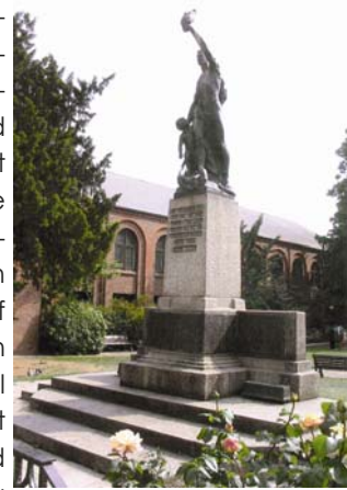
© Royal Borough of Kingston ▲

This Grade II listed War Memorial stands within a conservation area. It was designed in 1920 and erected by sculptor R R Goulden. It features a set of bronze figures standing on a granite pillar with lettering in relief and bronze Roll of honour attached spreads onto two lateral granite extensions. A grant of £3,000.00 was awarded towards costs of cleaning and conservation works.