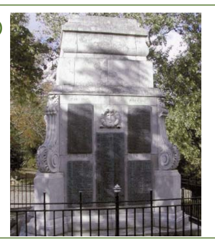
Stockton on Tees Borough Council

This limestone cenotaph surmounted by acanthus leaf scrolls and featured with corner buttresses, relief decorations and inset granite roll of honour plaques was unveiled on July 28th, 1921 by Colonel Spence. A grant of £3,900.00 was awarded towards the repair and conservation works.