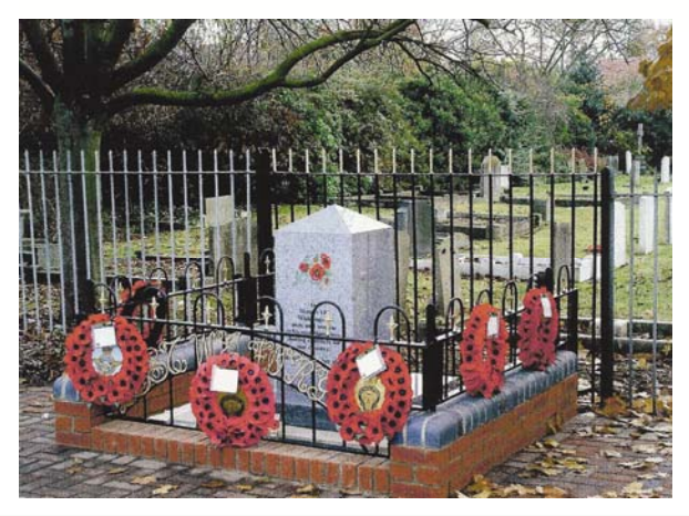
Waddington War Memorial (LincoInshire) FoWM awarded a £250 grant for the commissioning of a war memorial commemorating local residents who died in the two World Wars.

FoWM awarded a £200 grant for the commissioning of a war memorial commemorating those the men from Walpole who died in the two World Wars. The war memorial war erected at St Mary's Church.