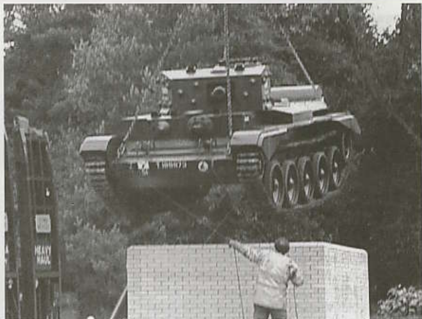
Desert Rats Memorial