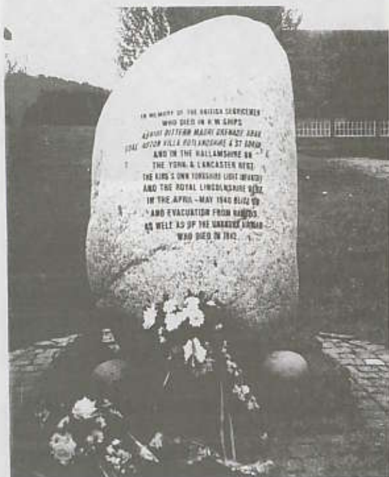
Memorial at Namos