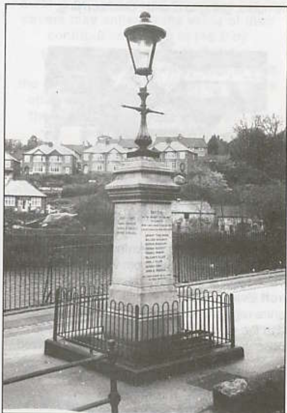
Scarthin war memorial, Cromford, Derbyshire.