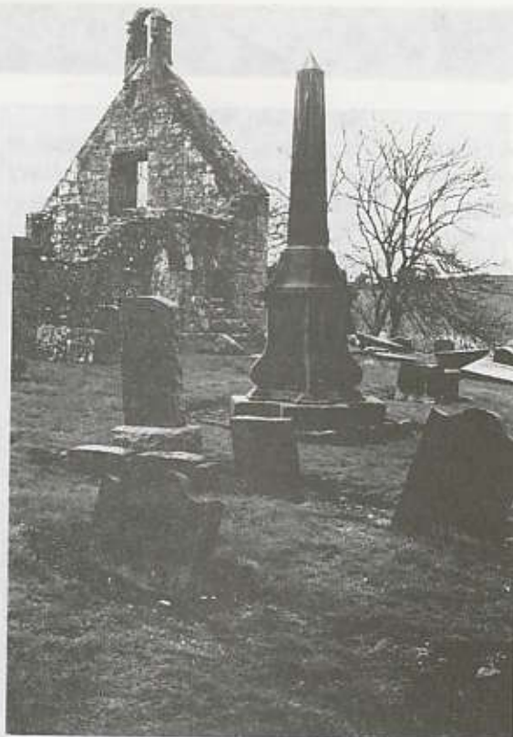
Carnock War Memorial, Fife. A Scottish war memorial "at risk".

We will keep readers informed of any changes or new strands of grant aid relevant to war memorials.