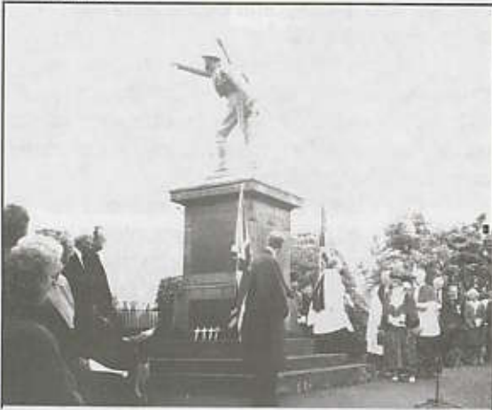
Bridgnorth War Memorial unveiled