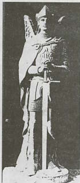
The recovered bronze figure of St Michael

Police immediately posted a picture of the statue on the internet, which was spotted by a London antique dealer to whom it had been offered for sale. The statue has been recovered and will soon be returned to its rightful home.