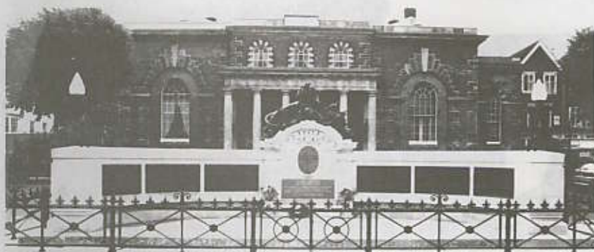
Guildhall Square memorial

This fine WWI memorial, a curved stone wall with bronze panels and crowning sculpture (a lion flanked by helmet, arms and draped regimental colours), has been cleaned and repaired by the local council. Missing glass lanterns have been replaced so the memorial can be illuminated, and a new plaque, remembering casualties from WWII and subsequent conflicts, has been added.