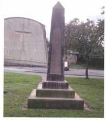
Radford St Nicholas memorial without its missing plaque

In 2013, the memorial was targeted by thieves. Sadly, three of the five bronze plaques were stolen but one was later recovered having been discarded by those who had removed them. The community temporarily removed the other plaques as shown in the image left. The case received a lot of media attention at the time as the issue of metal theft was