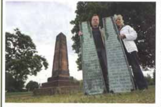
Members of the local community with some of the removed plaques

The memorial consists of a Runcorn stonework obelisk raised from ground level on a three-stepped base. Mounted on each elevation of the obelisk is a bronze plaque commemorating those who served and died in World War I. A rectangular bronze dedication plaque is mounted on the stepped base. The memorial is located on open church land between St Nicholas Church and Radford Road.