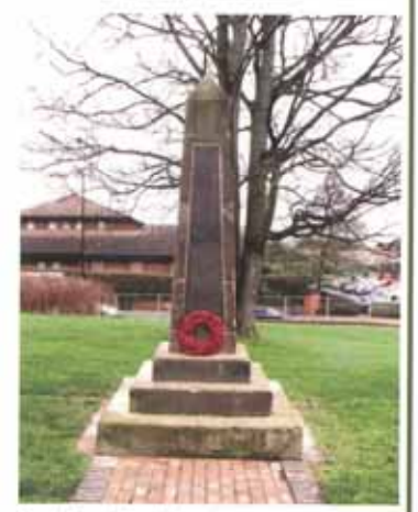
Radford St Nicholas memorial after works

War Memorials Trust gratefully acknowledges the support of Department of Culture, Media and Sport, Historic England, Historic Environment Scotland and The Pilgrim Trust for its Conservation Programme.