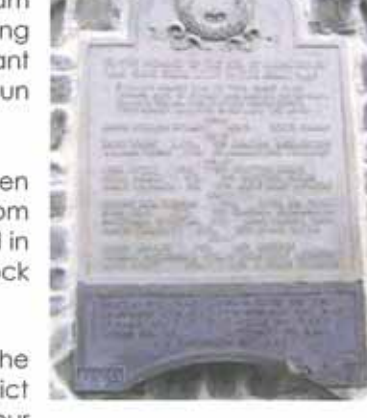
The memorial is situated in the grounds in front of the deconsecrated St. John's Church, Deskford, which is now a private residence. It is just behind the railings separating the grounds from the B9018 and is easily visible from the road. The memorial is ten feet high, tapering towards the top, and made of Kemnay granite. It has a domed top and a stepped base. An inscription and names are incised in black lettering and above the inscription is carved a black Maltese cross.

Details on other completed projects grant aided are available on our web site.