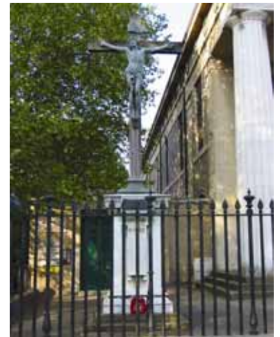
War memorial calvary, St John's Church, Waterloo, London (WM3975)