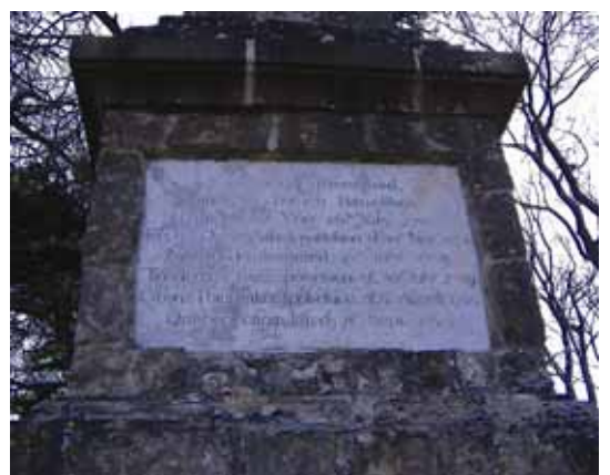
Montreal Park memorial shown after work at top with detailed images of inscriptions before and after work above © Montreal Park Residents Association, 2006 and 2010