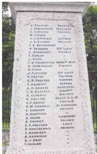
Inscriptions after work