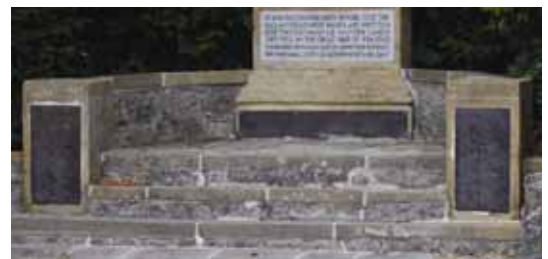
Re-pointed joints