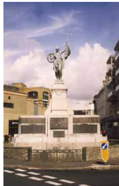
Folkestone war memorial © Jim Corke, 2009