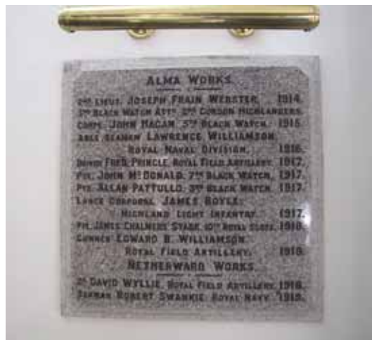
Alma Works and Netherward Works war memorial