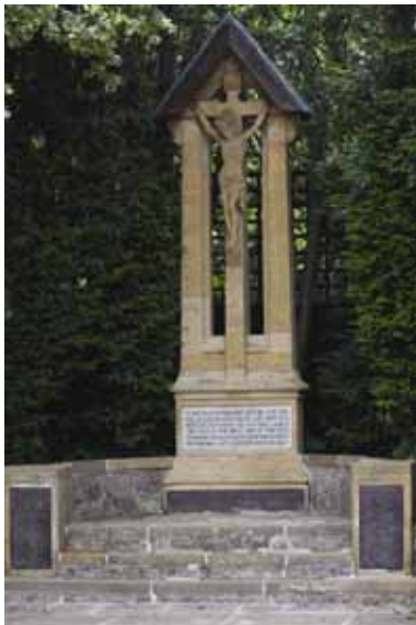
Castle Donington war memorial

Castle Donington war memorial stands on the High Street in a conservation area. The calvary includes a limestone figure of Christ beneath a timber gable. A limestone tablet carries the inscription with bronze plaques detailing the names of the fallen on the flanking walls.