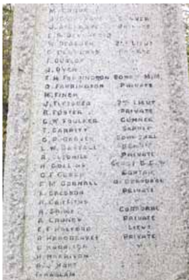
Inscriptions prior to work

The memorial was paid for by employees of the former Horwich Locomotive Works. The sculptor was Paul Fairclough and the memorial was unveiled in August 1921.