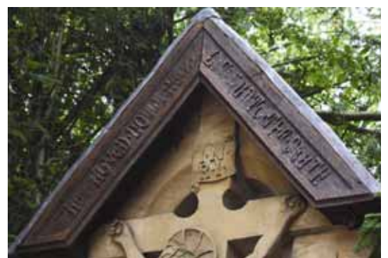
Treated timber and new lead capping

Details of other completed projects grant aided are available on our website.