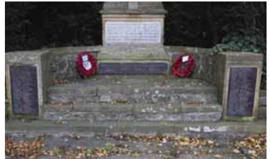
Open joints before works

"Ye who pass by, remember before God the gallant dead whose names are written here, though many lie in other lands they fell in the Great War of 1914-1919. The Men were very good unto us, and we were not hurt. They were a wall unto us both by night and day"