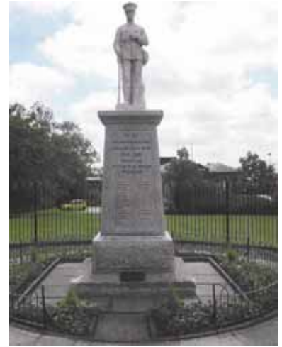
Horwich war memorial

Horwich Locomotive Workers' war memorial is located in the industrial estate on Chorley New Road and is sited within a small paved area bordered by railings. The memorial is composed of a granite plinth on which the incised inscription and names of the fallen are recorded; both name and rank are detailed. This is surmounted by a marble statue of a soldier in mourning pose with his rifle by his side. The memorial is located within a conservation area.